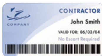
Prints inexpensive disposable bar-coded paper badges

With PassagePoint AC Integration Add-On, there is no delay in activating or deactivating access cards. Everything is immediate, including reports generated by PassagePoint and your access control system. It lets you program badges to de-activate on specified dates and times. This eliminates the risk of stolen or missing cards, and makes it safer to provide temporary access to employees or visitors who lose or forget their cards. And with random access numbering logic, PassagePoint Access Control virtually eliminates fraudulent badge numbers and accidental duplication.