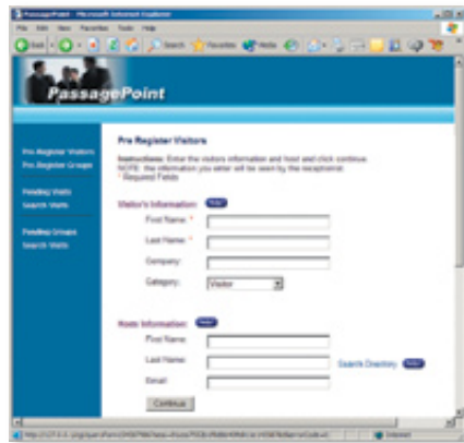
PassagePoint Enterprise v4.5's Web Pre-Registration module lets employees pre-register visitors

"We know exactly what's going on in our lobby, thanks to PassagePoint... PassagePoint works!"